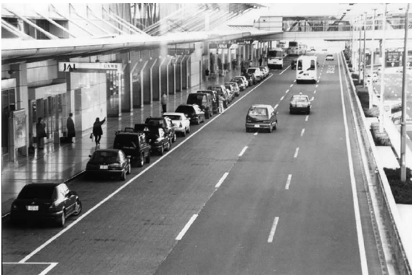
airport terminal / so

In this part, you can move to the next question by clicking on Next . If you want to return to a previous question, click on Back . You will have 8 minutes to complete this part of the test.