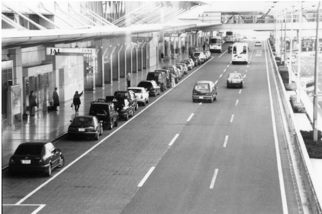
airport terminal / so

In this part, you can move to the next question by clicking on Next . If you want to return to a previous question, click on Back . You will have 8 minutes to complete this part of the test.